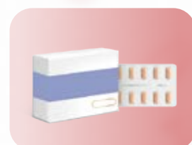
Detection of heparin therapy