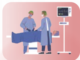
Perioperative Bleeding Management