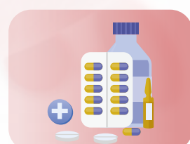
Monitoring of antiplatelet therapy